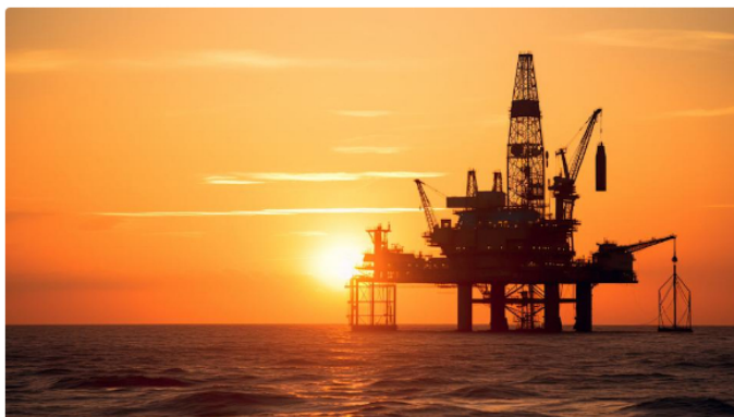
Ecopetrol (EC) Downgraded at Moody's, Outlook Revised to Negative

Ecopetrol S.A. (NYSE:EC) is included among the 10 Best Energy Stocks to Buy Under $20 According to Billionaires.