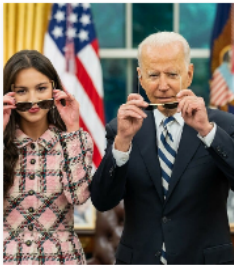
Here's How Big Joe Biden's Social Security Check Is – To the Dollar