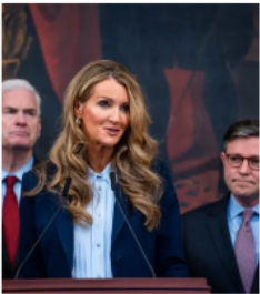
SBA Orders More Than 4,300 Small Businesses to Produce Financial Records in Fraud Clampdown