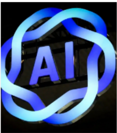
AI Safety Researcher Resigns With 'World Is in Peril' Warning