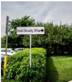
Gen X Workers Staring Down a 'Retirement Crisis,' Apollo Chief Economist Warns