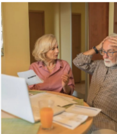
Here's What Could Happen if Trump's 10% Credit Card Interest Cap Gets Approved