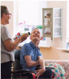
Trump Proposes Cutting SSI to Nearly 400,000 Recipients: Could It Hurt You or Someone You Love?