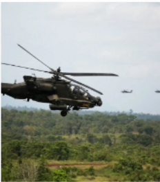
Boeing Wins More Than $7 Billion in Pentagon Contracts