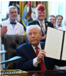
President Trump's Shocking Medicare Advantage Announcement Is a Mixed Bag for Seniors