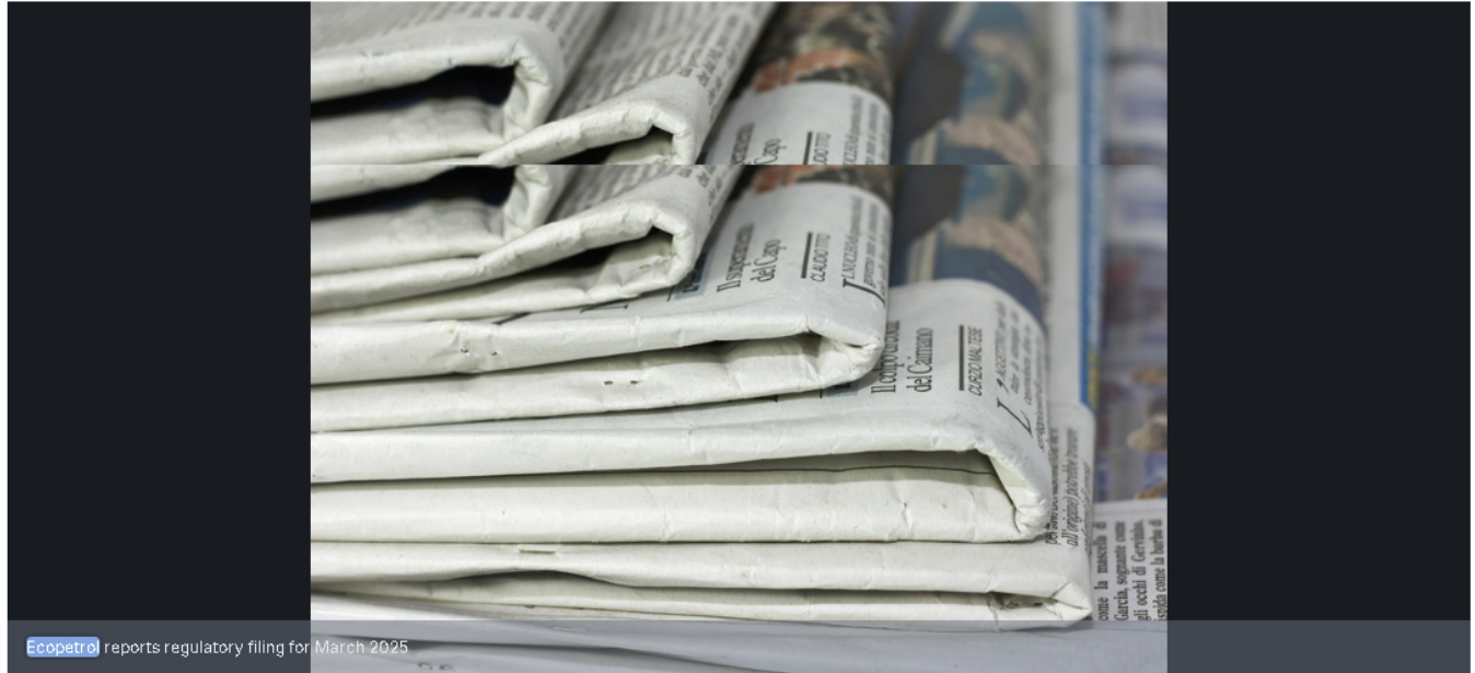
Ecopetrol reports regulatory filing for March 2025