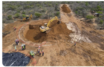
Construction of the Windpeshi wind farm in La Guajira, Colombia.

Colombian state oil company Ecopetrol SA (NYSE:EC) has made a formal offer to acquire the 205-MW Windpeshi wind farm project from Enel Colombia, according to a report in Colombian business newspaper La Republica.