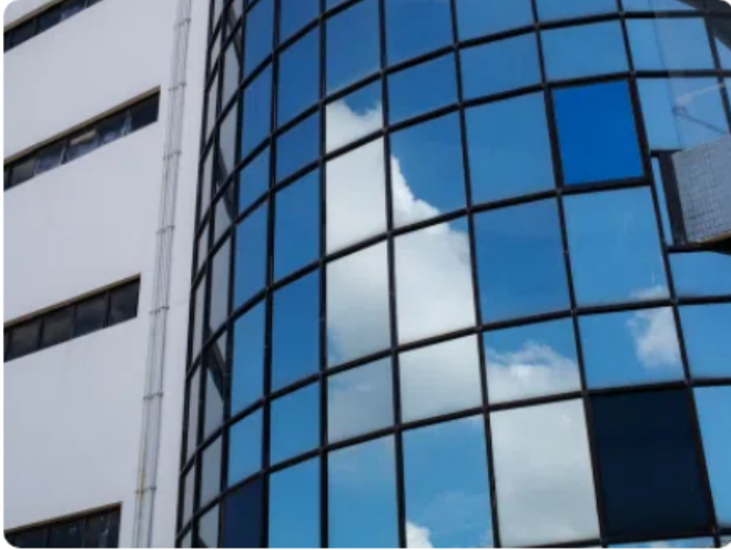
Kodiak Gas Services Inc (KGS) Stock: Navigating a Year of Volatility