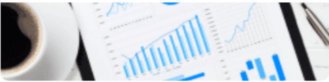
GGB's Market Seesaw: Yearly Gains & Recent Declines – What to Expect?