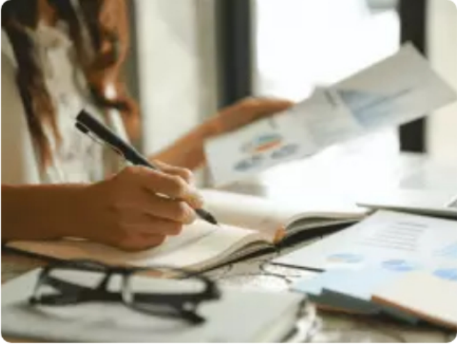
HMY's Stochastic Averages Dip: Analyzing Harmony Gold Mining Co Ltd ADR's Stock Performance