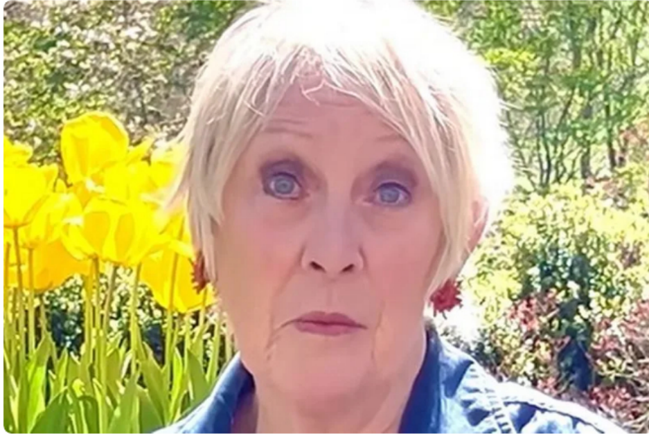
Carol Klein announced she had been diagnosed with cancer

Gardeners' World star Carol Klein has revealed she has been diagnosed with breast cancer. The popular TV presenter explained to fans that she had undergone a double mastectomy following the diagnosis.