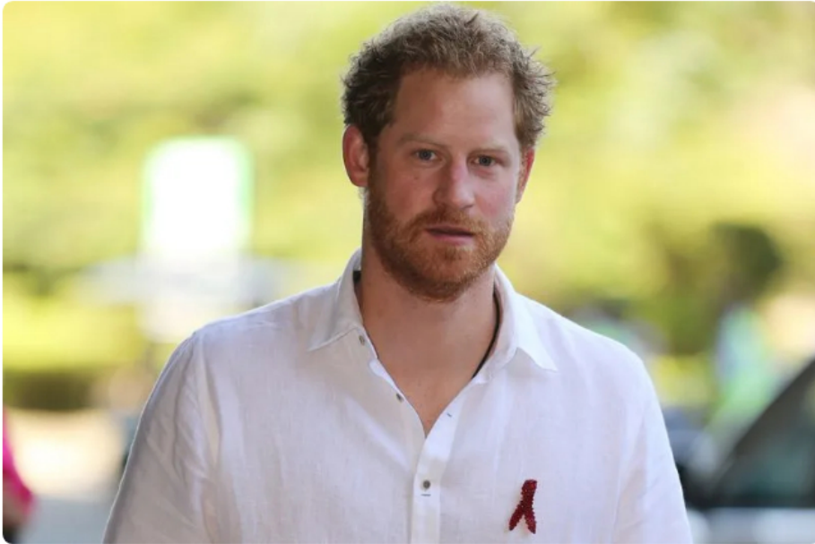
The Duke of Sussex, 39, will be in London for the Invictus Games' 10th anniversary ceremony

The source said: "Harry has kept in regular contact with his father on several occasions and made no secret of his desire to see him when he can. He has been especially concerned about him and hopes the King will be well and able to see him as planned."