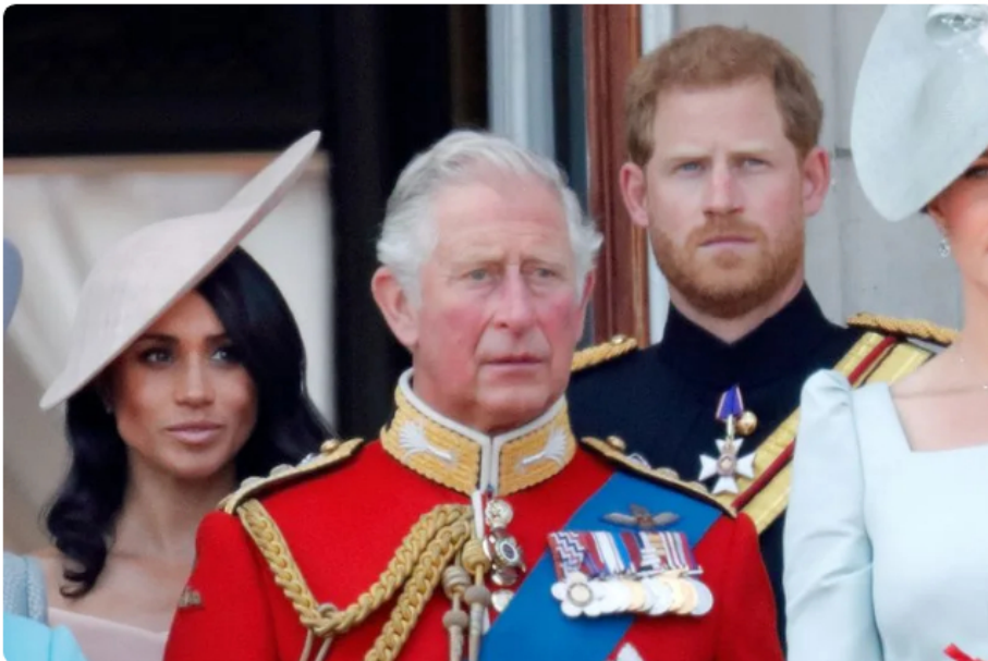
Prince Harry has reportedly extended an olive branch to his father King Charles

While experts think a catchup between estranged brothers Williams and Harry is off the cards , it's reported that the Duke of Sussex will make time to see his father, King Charles III , 75, who is also currently receiving treatment for an unnamed cancer.