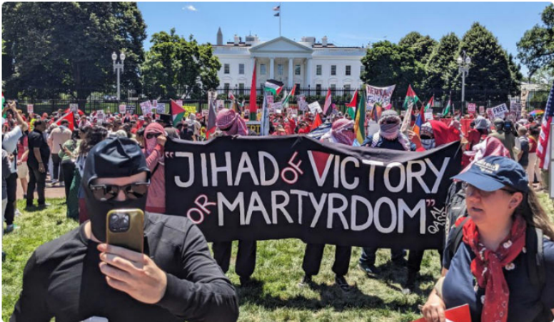
Protesters Surround White House, Call for 'Intifada Revolution'

A man wearing a black ski mask and holding a megaphone approached me and asked if I was "Zionist" or "Israeli." When I did not respond, he followed me and shouted through a megaphone, "Stay away from the Zionist." He told me he was "with the H-Team, the people who start with 'H.'"