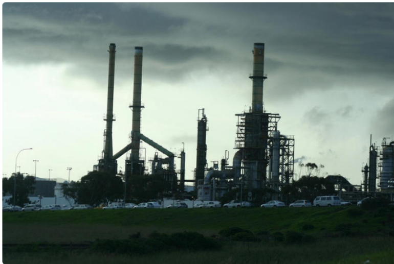
Colombia Bleeds Nearly One Billion Dollars in Oil Theft

Recent reports revealed that Colombia has suffered losses of nearly one billion dollars over the past five years due to oil product theft .