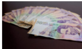
All Eyes Are Watching