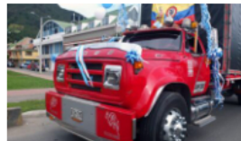
What Jumps Out: Positive