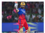
IPL 2024: Virat Kohli's unbeaten 113 lifts Royal Challengers Bengaluru to 183/3