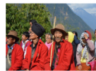
Top Arunachal cop suggests utilising services of 'Gaon Burahs' during elections