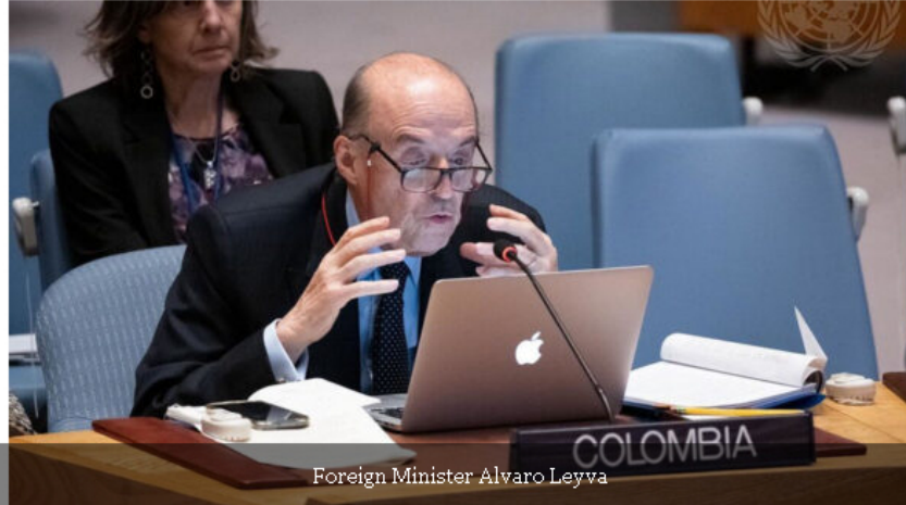
Foreign Minister Alvaro Leyva