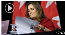
Here are the key takeaways from Canada's budget update