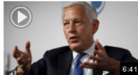
Canada's ambassador to China steps down after Huawei crisis