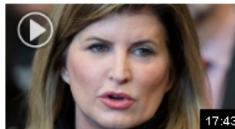
Rona Ambrose: Fiscal update 'very concerning' for Canadians