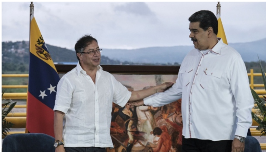
Gustavo Petro, Colombia's president, left, and Nicolas Maduro, Venezuela's president, meet at the Tienditas International Bridge in Cucuta, Colombia, on Thursday, Feb. 16, 2023. During the meeting near the border, the heads of state signed a memorandum of understanding focused on modernizing trade rules between Colombia and Venezuela.