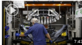
Trudeau weighs auto-content rules as next U.S. trade flashpoint