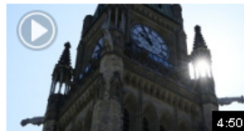
'A long time coming': Ottawa looks at requiring corporate climate disclosures