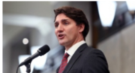
Canada joins U.S., U.K. in diplomatic boycott of Beijing games