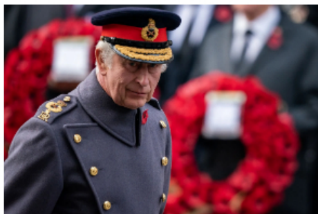
CARLOS III WILL BE CROWNED ON A 7-