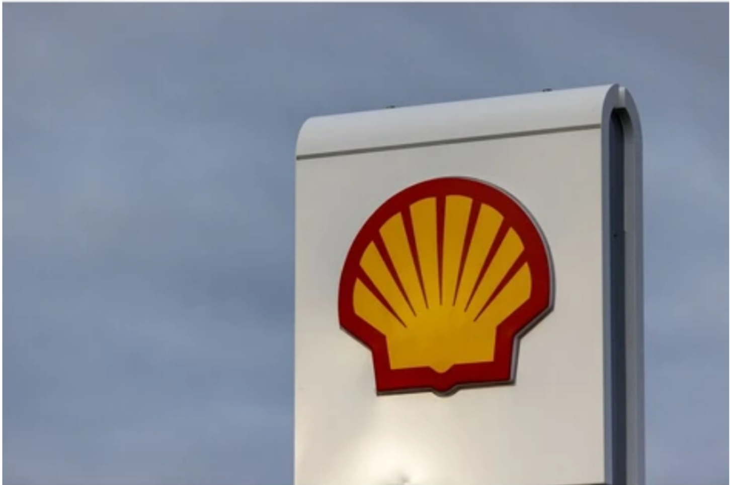
The Shell Plc company logo on a totem sign at the entrance to a petrol station in Billericay, UK, on Wednesday, Feb. 1, 2023. Shell posted a fourth-quarter profit that was well ahead of expectations as its natural gas business thrived, lifting the oil major to a record performance in 2022 fueled by soaring energy prices.