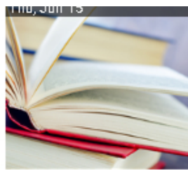
Vampire Book Club @ The Valdosta-Lowndes... South Georgia Regional...