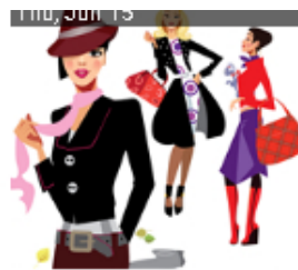
"Swap your Coupons!" @ The Echols County... South Georgia Regional...