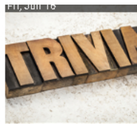
American Legion Post 13 holds Trivia Night American Legion Post 13