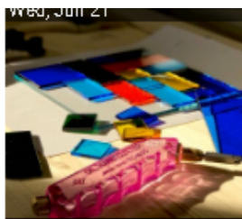
Fused Glass Richard Hill Glass Studio