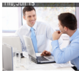
Computer Classes @ The Valdosta-Lowndes... South Georgia Regional...