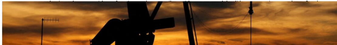
The sun sets behind a crude oil pump jack on a drill pad in the Permian Basin in Loving County, Texas.

Western sanctions on Russia's crude and oil products have opened the door to rising demand for US crude grades as many