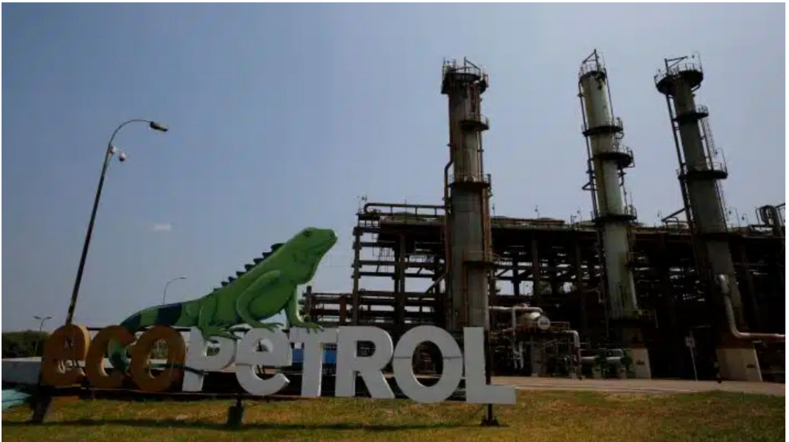
Ecopetrol plant.

The re-establishment of relations between Venezuela and Colombia covers, in addition to the border issue, energy issues. Any negotiations in this regard must pass through morass of the unilateral "sanctions" of the United States.