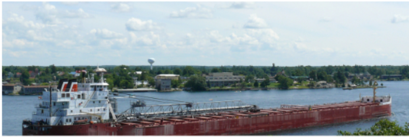
Lake freighter CSL Niagara on the St. Lawrence River near Alexandria Bay in the Thousand Islands

Unifor had conducted negotiations through a conciliator after discussions stalled with SLSMC management. The union, reluctant to move towards a required 72-hour strike notice, has sought to renew negotiations with the conciliator.