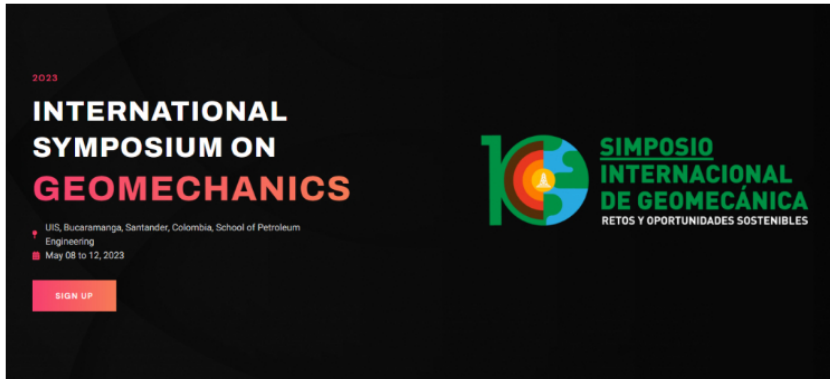
10th International Symposium on Geomechanics