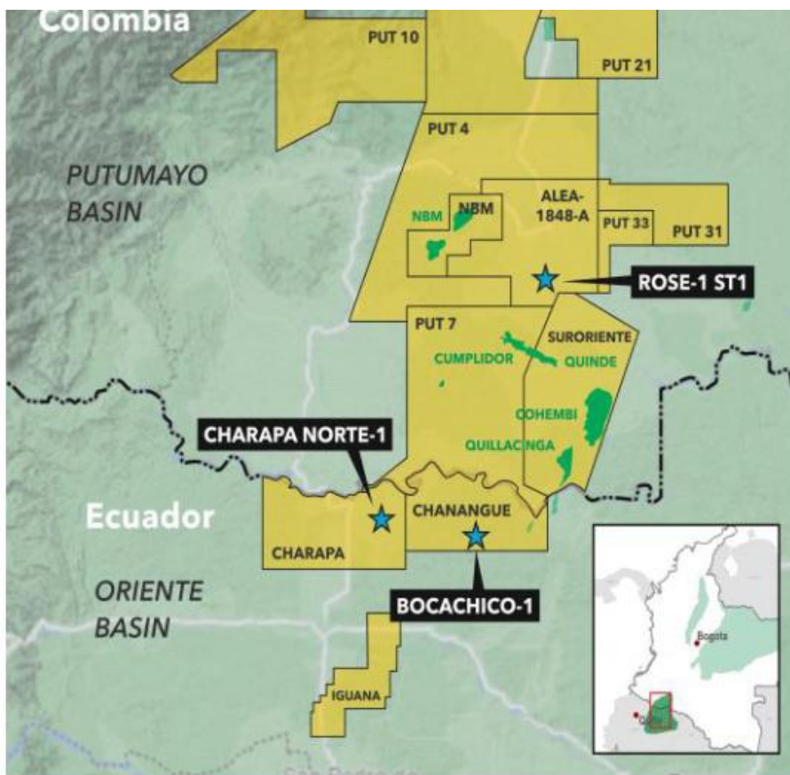
Location of Suroriente Block

Gran Tierra became the operator of Suroriente in March 2019 with a 52% working interest ('WI'), with Ecopetro holding the remaining 48% WI. Since becoming the operator, Gran Tierra has been able to increase 100% gross oil production from an average of 6,203 barrels of oil per day ('bopd') in February 2019 to an average of 8,167 bopd during first quarter 2023, an increase of 32%. The Company has also expanded the Cohembi enhanced oil recovery ('EOR') project , which is designed to increase the ultimate oil recovery and value of the block. Suroriente's first quarter 2023 average production of 8,167 bopd gross (4,247 bopd WI) was its second highest quarterly average production average since second quarter 2015, despite no development wells being drilled since first quarter 2018.