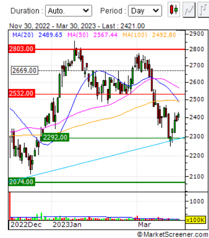
Chart ECOPETROL S.A.