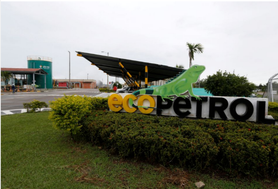
The entrance of Ecopetrol's Castilla oil rig platform is seen in Castilla La Nueva, Colombia