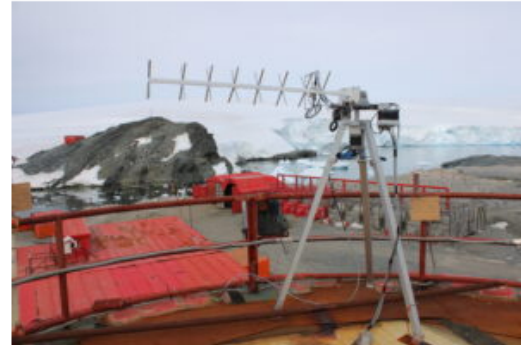
The photo shows a portable satellite antenna during a test at the FACSAT-1 temporary ground station at the Chilean Army's General Bernardo O'Higgins Base on January 19, 2020.