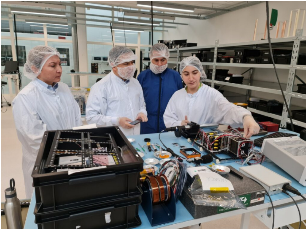
A group of CITAE engineers test the FACSAT-2 camera at the GomSpace laboratory in Denmark, September 14, 2022.