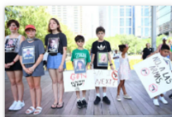
Your letters for May 28, 2022: Go after NRA, gun makers...