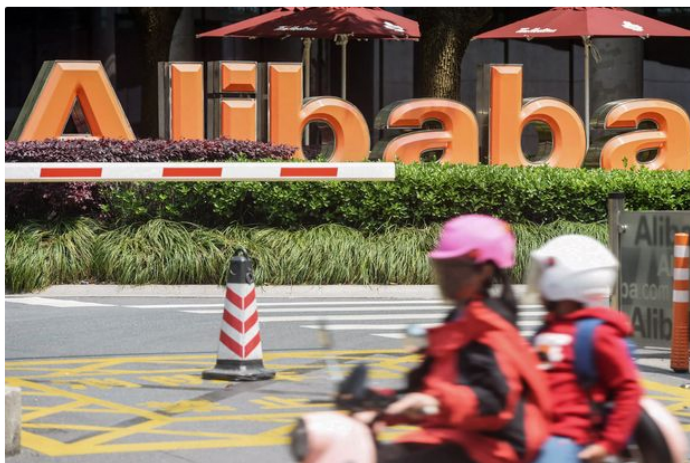
Value managers are jumping into Alibaba's stock, even as they acknowledge the risks.

When discussions turn to China , one question that always pops up from U.S. investors: Is it safe yet to buy Alibaba Group Holding the e-commerce juggernaut that has been battered over the past two years amid the country's crackdown on technology?