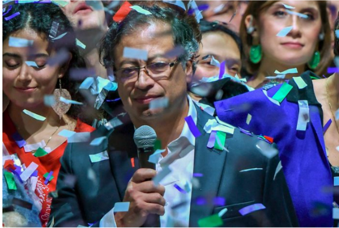
Newly elected Colombian President Gustavo Petro tilts to the left politically. It remains to be seen how far.