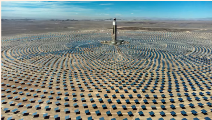
A thermosolar power plant in Chile. The country's new president has touted his green credentials but his first big economic package included fossil fuel subsidies