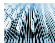
Down with the KIDS (The AIC)