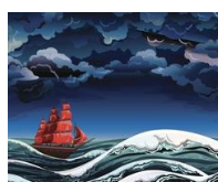
Navigating choppy waters (The AIC)