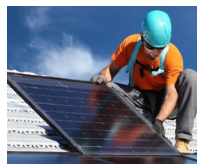
Latin America's Renewable Riches (LatAM INVESTOR)