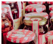
Preserving capital (The AIC)