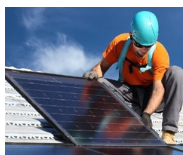
Latin America's Renewable Riches (LatAM INVESTOR)