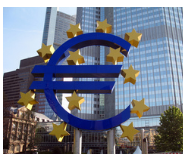
The UK before Brexit (The AIC)