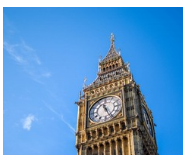
Two views make a market (The AIC)