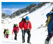
Leading the way (The AIC)