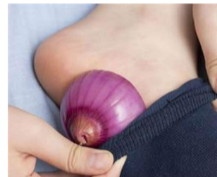
Diabetes Will Kill You (Do This To Stop It)