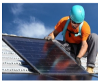
Latin America's Renewable Riches (LatAM INVESTOR)