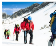
Leading the way (The AIC)

While talking about Ecopetrol S.A. (NYSE:EC) valuation ratios, the stock trades with a P/S and P/B of 2.3 and 2.66 which is significantly better and attractive as compared to its peers.