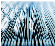
Down with the KIDs (The AIC)