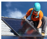
Latin America's Renewable Riches (LatAM INVESTOR)