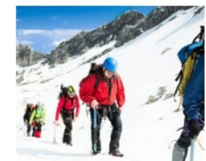
Leading the way (The AIC)