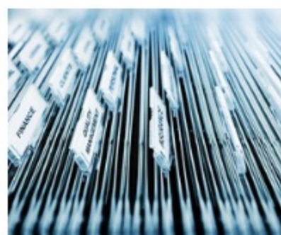
Down with the KIDs (The AIC)