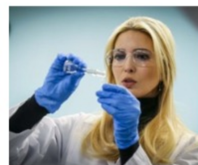
The No.1 Biotech Stock to Buy by March 28th (Behind the Markets)