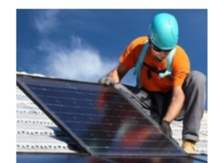
Latin America's Renewable Riches (LatAM INVESTOR)