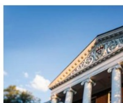
Our comprehensive leadership programs turn executives into visionaries (HBS Executive Education)