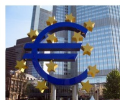
The UK before Brexit (The AIC)