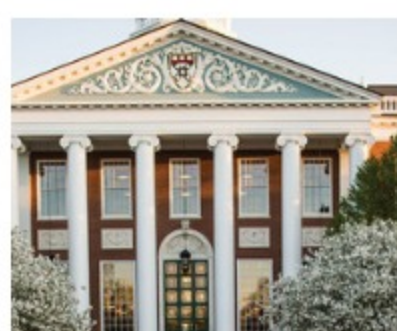
Learn more about the Certificate of Management Excellence (HBS Executive Education)