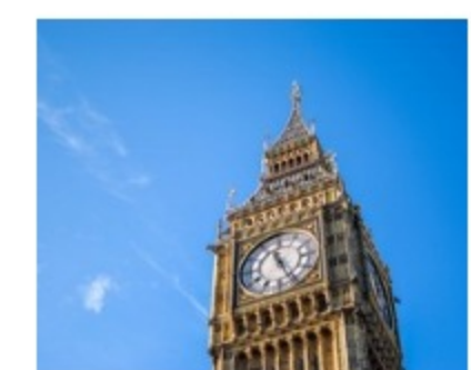
Two views make a market (The AIC)