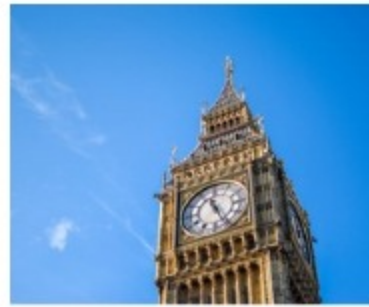
Two views make a market