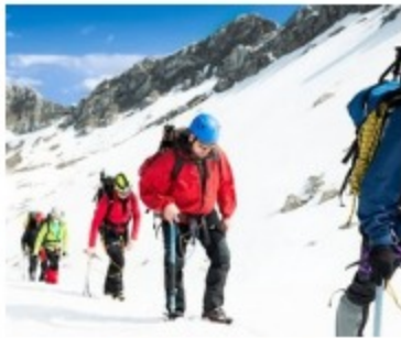
Leading the way