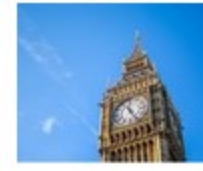
Two views make a market The AIC