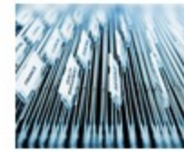
Down with the KIDs The AIC