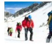
Leading the way The AIC