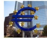
Latin America's Renewable Riches LatAM INVESTOR