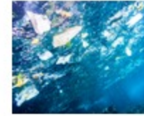
Backing a greener future The AIC