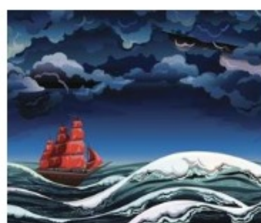
Navigating choppy waters