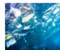
Backing a greener future The AIC