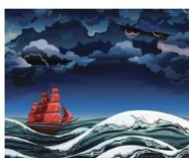
Navigating choppy waters (The AIC)