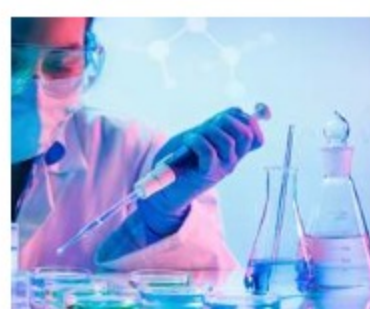
Healthy prospects (The AIC)