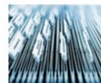
Down with the KIDS The AIC