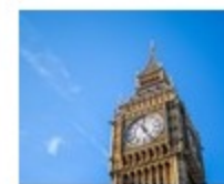
Two views make a market The AIC