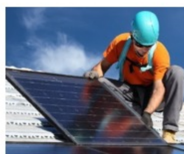
Latin America's Renewable Riches (LatAM INVESTOR)