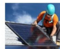
Latin America's Renewable Riches LatAM INVESTOR