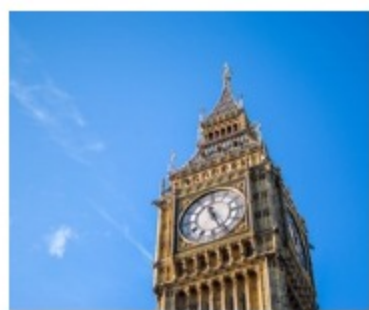
Two views make a market (The AIC)