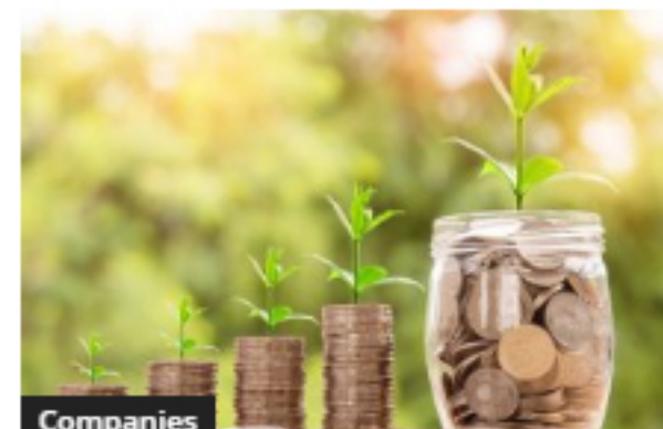
Micron Technology, Inc. (MU): How Do the Books Stack Up?