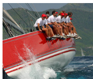
Markets Resume Upward Climb