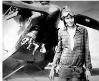
Amelia Earhart Found? Plane Fragment Identified as Pilot's