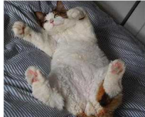
He is The Largest Cat in New York City - You Have to See Him!