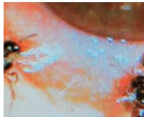
Four Small Bees Found Living in Woman's Eye