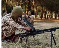
10-Year-Old Boy Kidnapped by ISIS Reveals Horrors of Life as a Child Soldier