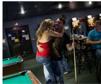
Here's How You Know Whether Someone's Attracted to You or Not