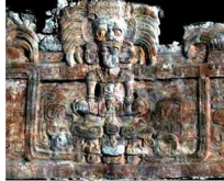
Secret Mayan Tombs Discovered Beneath Pyramids