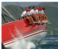
Markets Resume Upward Climb (ETF Global)