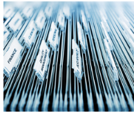
Down with the KIDS (The AIC)