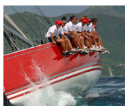
Markets Resume Upward Climb