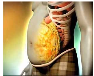
One Cup of This (In The Morning) Burns Belly Fat Like Crazy!