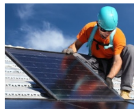
Latin America's Renewable Riches (LatAM INVESTOR)

While talking about Ecopetrol S.A. (NYSE:EC) valuation ratios, the stock trades with a P/S and P/B of 2.17 and 2.63 which is significantly better and attractive as compared to its peers.