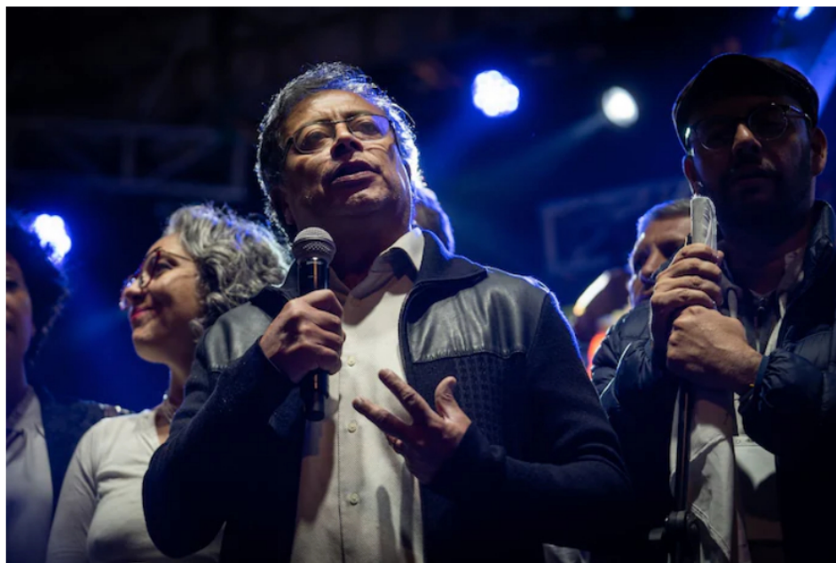
Gustavo Petro