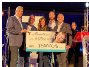
The YMCAs of Québec Foundation exceeds its