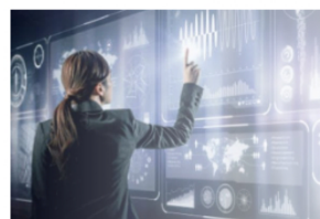
HostColor Promotes Open-Source Web