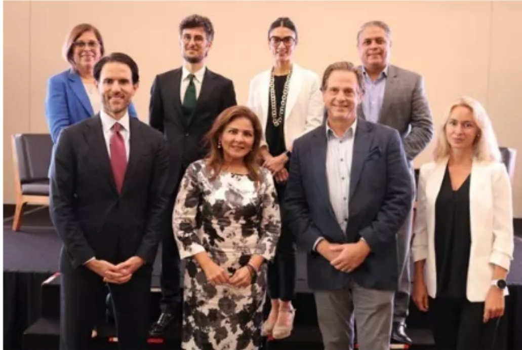
World Economic Forum representatives with the Executive Director of the Partnership for Central America and representatives from Harvard University, Ecopetrol , PwC, Holcim El Salvador and Fundemas.