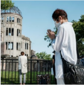
Op-Ed: Why is Russia so blasé when talking about World War 3?