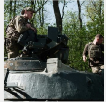
War in Ukraine: Latest developments

ABOUT US SPONSORED CONTENT TERMS OF USE PRIVACY POLICY CONTACT US