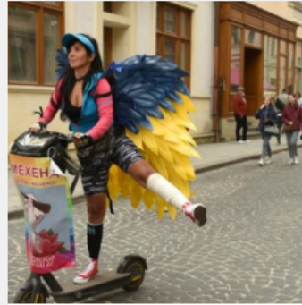
In Ukraine, displaced families replace the tourists