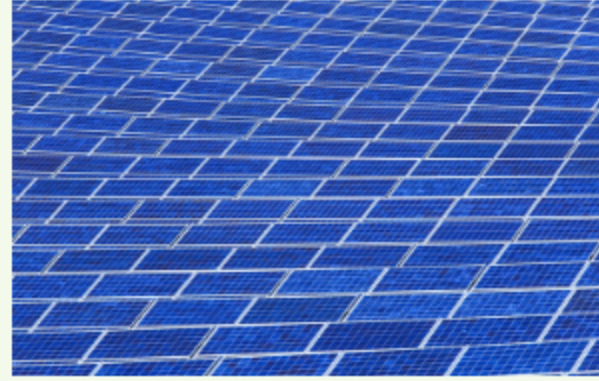
Solar panels by iamme ubeyou.

Ecopetrol commissioned the construction from energy provider AES Colombia, of AES Corp (NYSE:AES), according to Friday's press release. AES is also to supply electricity under a 15-year power purchase agreement (PPA), and provide operation and maintenance (O&M) services at Castilla.