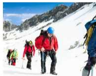
Leading the way (The AIC)

While talking about Ecopetrol S.A. (NYSE:EC) valuation ratios, the stock trades with a P/S and P/B of 2.22 and 2.57 which is significantly better and attractive as compared to its peers.