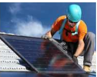
Latin America's Renewable Riches (LatAM INVESTOR)