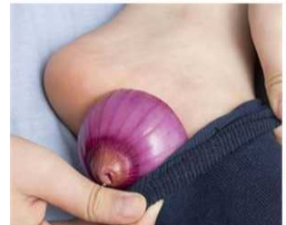
Diabetes Will Kill You (Do This To Stop It)