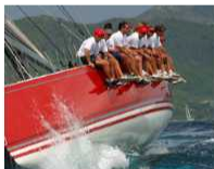
Marching On (ETF Global)