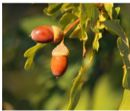
From acorns to oaks (The AIC)