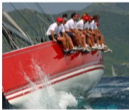
Markets Resume Upward Climb