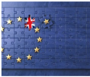
Brexit bargains (The AIC)