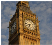
Brexit - UK economic prospects and outlook (The AIC)