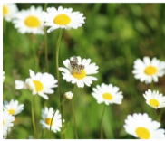
Small is mighty (The AIC)