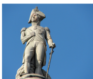
Dividend heroes: companies with dividend increase for 20 years or more (The AIC)