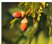
From acorns to oaks (The AIC)