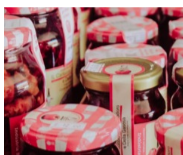
Preserving capital (The AIC)