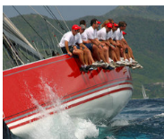
Markets Resume Upward Climb