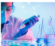
Healthy prospects (The AIC)