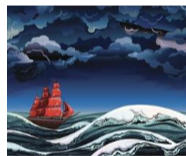
Navigating choppy waters (The AIC)