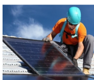
Latin America's Renewable Riches