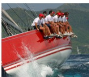
Markets Resume Upward Climb (ETF Global)