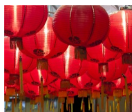
New Year Resolution? (The AIC)