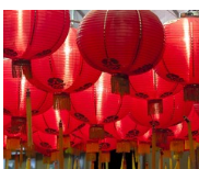
New Year Resolution? (The AIC)