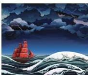
Navigating chopper waters (The AIC)