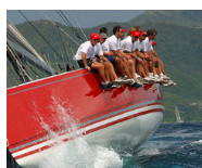
Markets Resume Upward Climb (ETF Global)