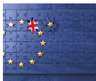
Brexit bargains (The AIC)