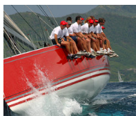
Markets Resume Upward Climb (ETF Global)